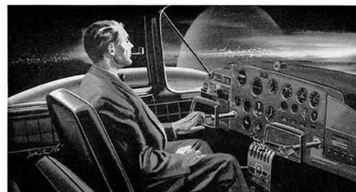
PICTURE OF A SATISFIED MAN